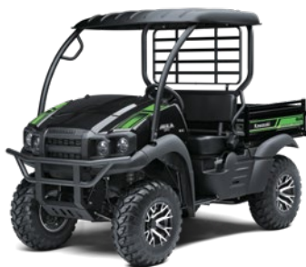
● Super Black