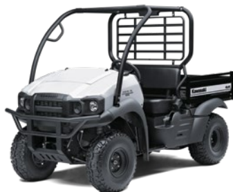
○ Bright White