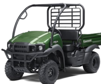
● Timberline Green ● Dark Royal Red