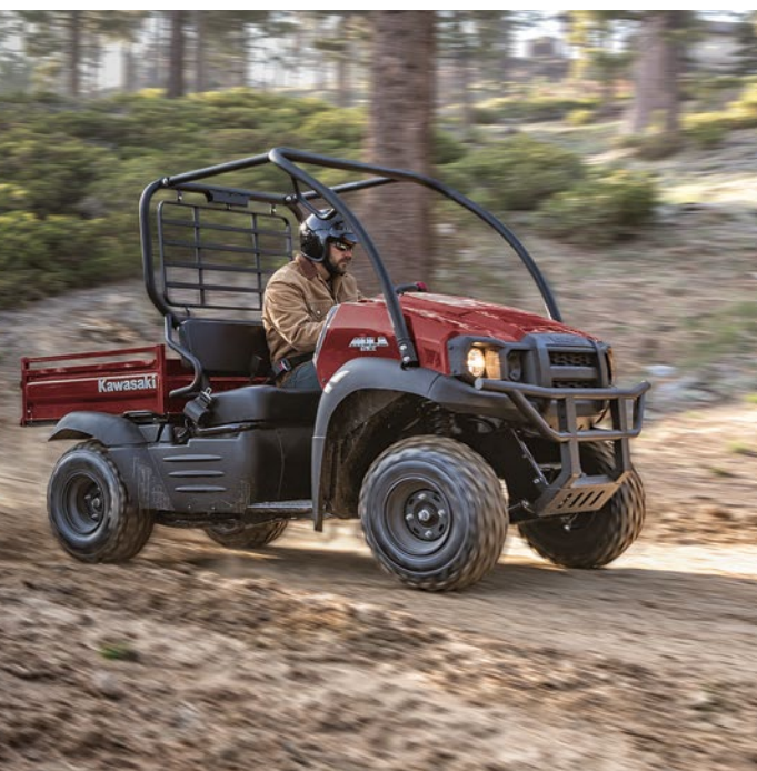
MULE SX™ in Dark Royal Red

The maneuverability of the MULE SX™ side x sides are beyond compare. The compact size and tight turning radius allow the MULE SX vehicles to venture into tight areas with ease. With their lightweight and small stature, they can even fit into the bed of a full-size pickup truck for easy transport.