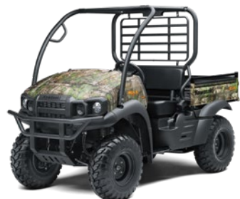
● Realtree Xtra® Green Camo