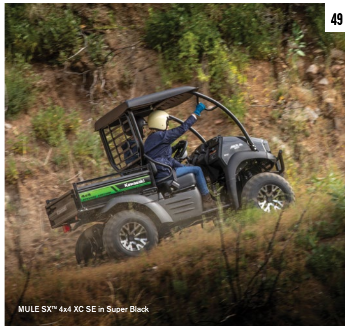
MULE SX™ 4x4 XC SE in Super Black

The MULE SX™ side x sides are powered by a strong, dependable 401cc single-cylinder four-stroke engine. A fully automatic Continuously Variable Transmission (CVT) has high and low forward ranges, providing simple operation and efficient engine range for a variety of loads or terrain.