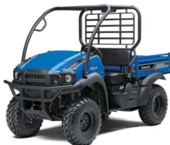
● Vibrant Blue