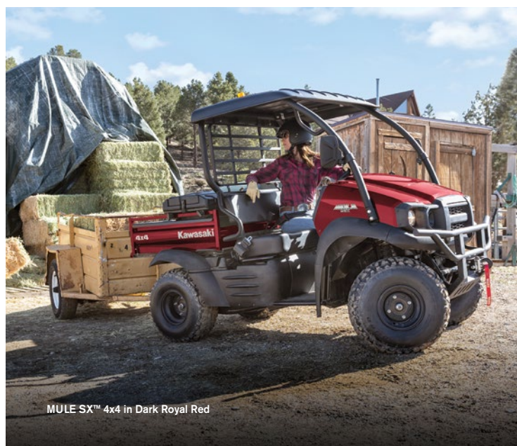
MULE SX™ 4x4 in Dark Royal Red