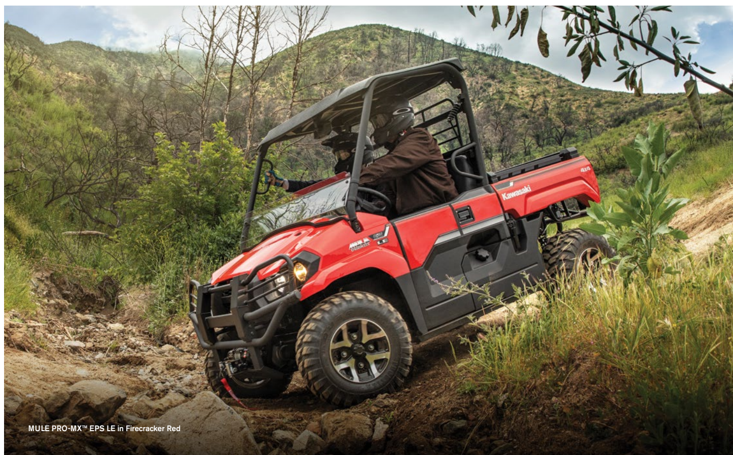
MULE PRO-MX™ EPS LE in Firecracker Red

The two-passenger MULE™ side x sides are for those who need to pack a powerful punch without hauling as many people. Don't take on the demands of your workday alone—let the MULE side x sides do the heavy lifting. Find the right MULE vehicle that fits your workload.