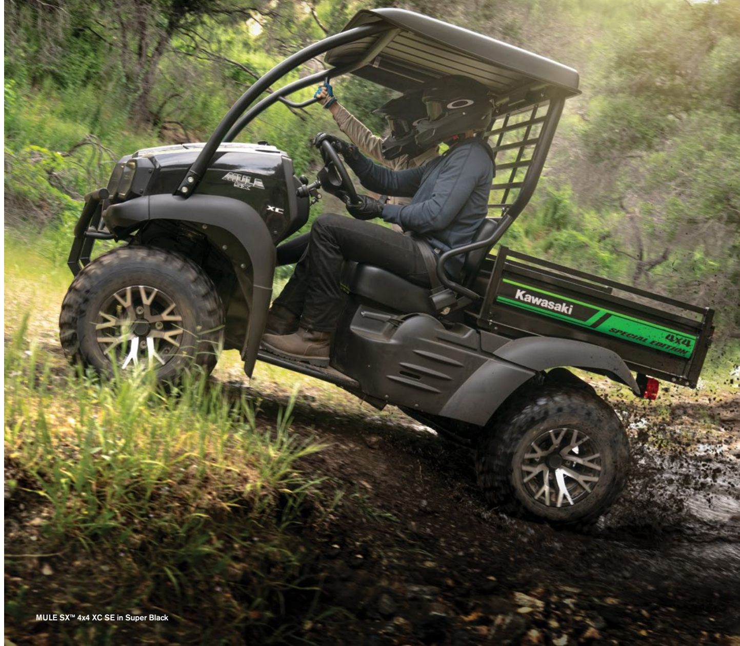
MULE SX™ 4x4 XC SE in Super Black

Styled in the image of its full-size MULE™ PRO siblings, MULE SX™ side x sides pack plenty of stout muscle into a compact and agile machine. Handle a wide variety of tasks with the ability to tread lightly and maneuver in tight areas or take a new path with the MULE SX™ 4x4 XC—a willing companion on the jobsite and on the weekends. Built rugged with off-road capability and reliable efficiency, MULE SX vehicles are ready for whatever your day has in store, whether it's work or fun.