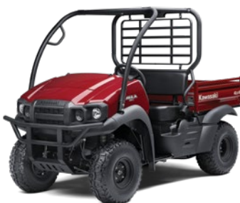
● Dark Royal Red ● Timberline Green