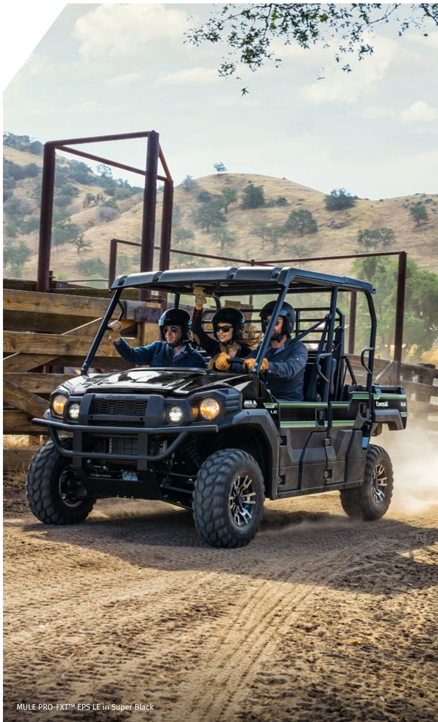
MULE PRO-FXT™ EPS LE in Super Black