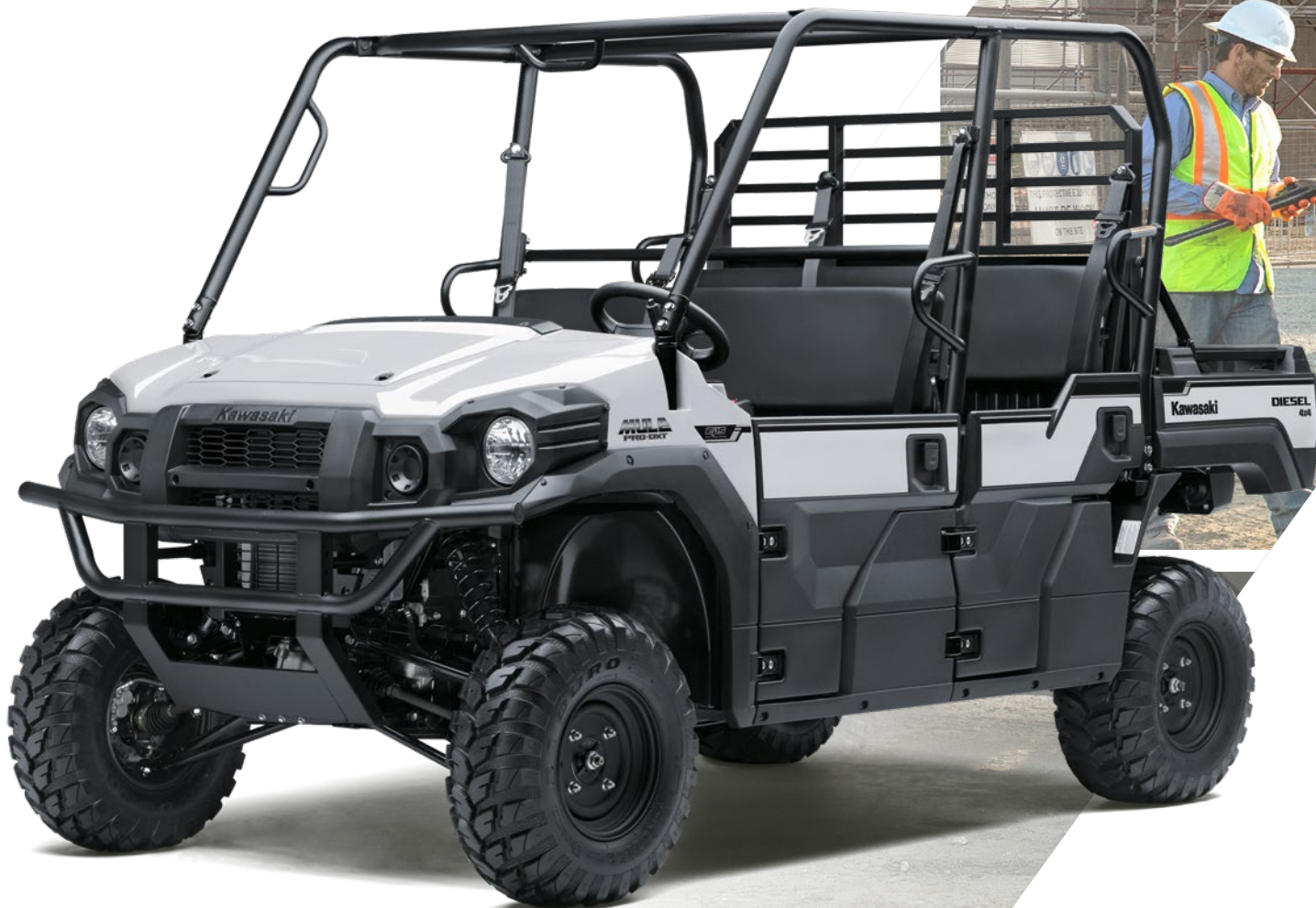
MULE PRO-DXT™ EPS in Bright White

The versatile MULE PRO-DXT™ side x side is outfitted with a rugged full-size chassis capable of moving gear, tools, materials and people around the jobsite with efficiency. A hardworking, built-to-last, 993cc diesel engine produces plenty of torque to tackle the task at hand.