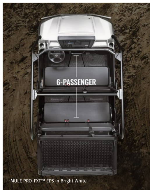
MULE PRO-FXT™ EPS in Bright White