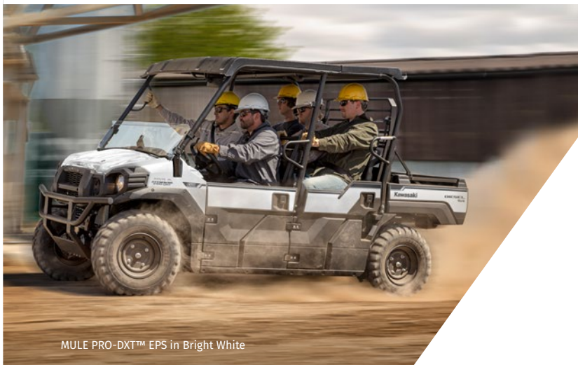
MULE PRO-DXT™ EPS in Bright White