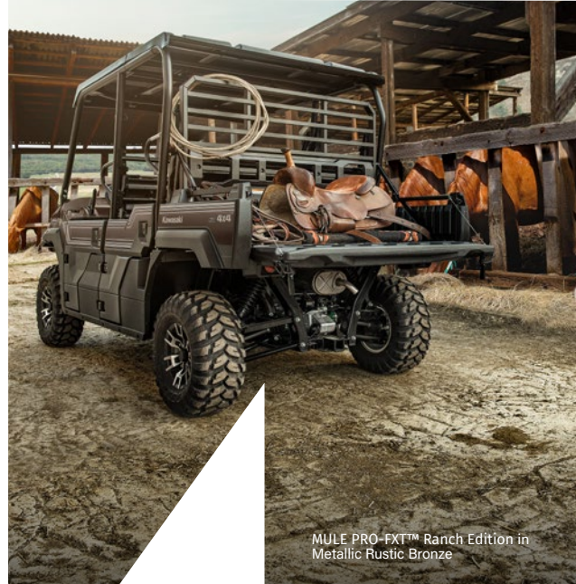
MULE PRO-FXT™ Ranch Edition in Metallic Rustic Bronze