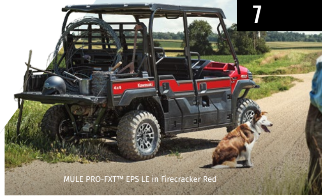
MULE PRO-FXT™ EPS LE in Firecracker Red