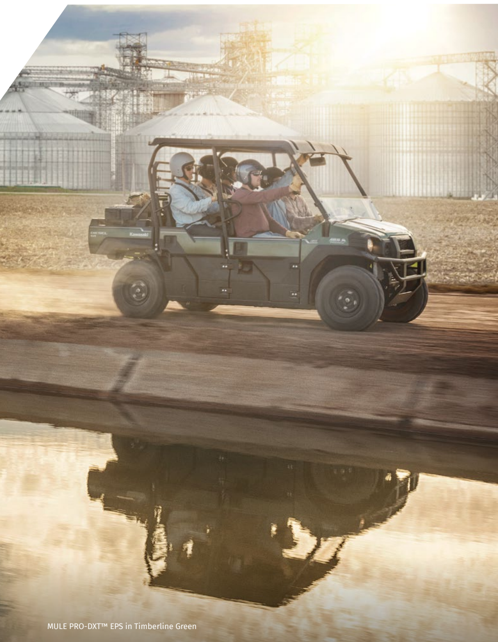
MULE PRO-DXT™ EPS in Timberline Green

Seat up to six passengers in the MULE PRO-FXT™ and MULE PRO-DXT™ side x sides. Get the job done with comfort, strength and durability and bring everyone along for the ride.