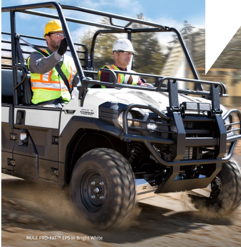
MULE PRO-FXT™ EPS in Bright White