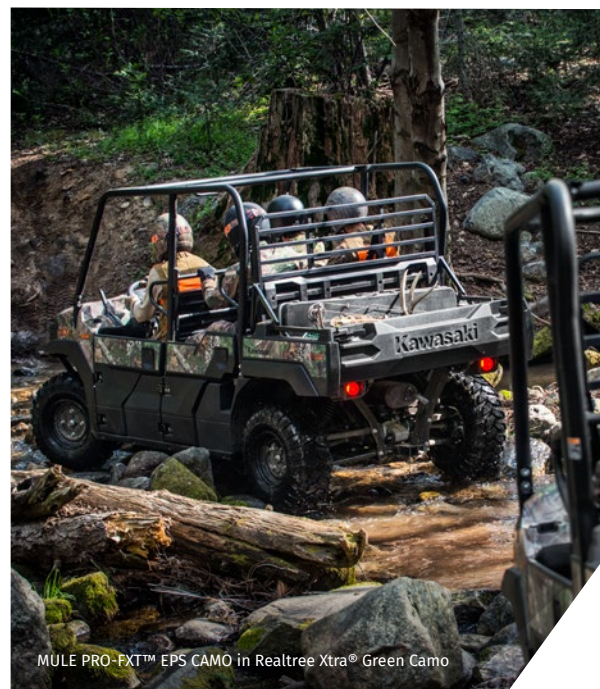
MULE PRO-FXT™ EPS CAMO in Realtree Xtra® Green Camo