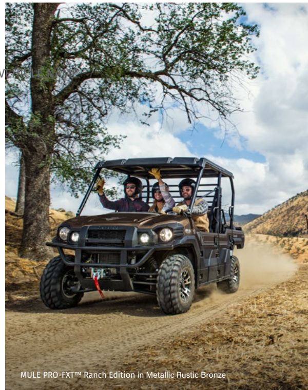
MULE PRO-FXT™ Ranch Edition in Metallic Rustic Bronze