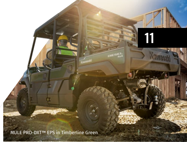
MULE PRO-DXT™ EPS in Timberline Green