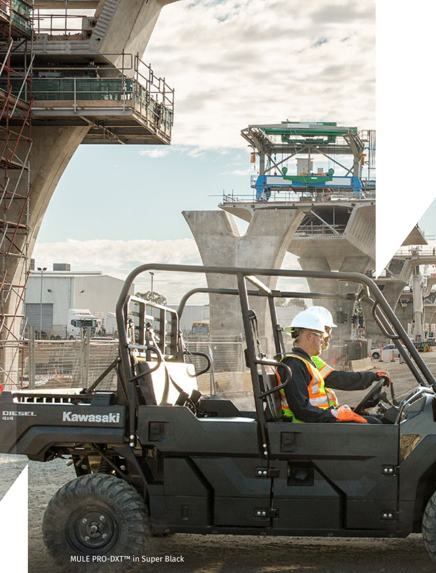
MULE PRO-DXT™ in Super Black