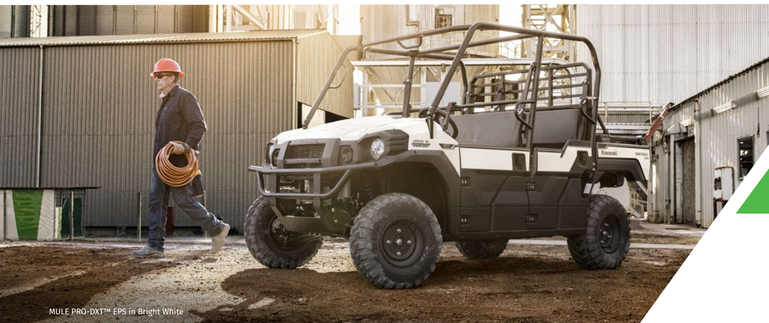
MULE PRO-DXT™ EPS in Bright White